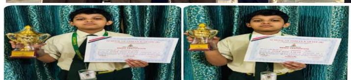
1st Prize in KATA individual Of Inter Dojo Karate Tournament